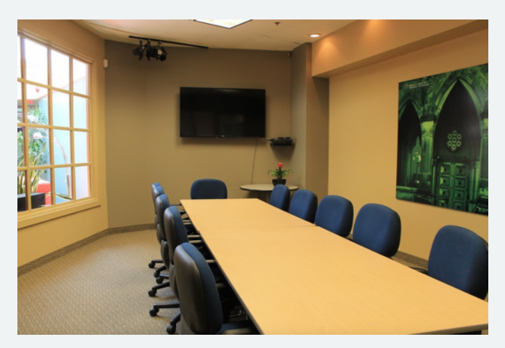
Fishbowl Boardroom Seats 12