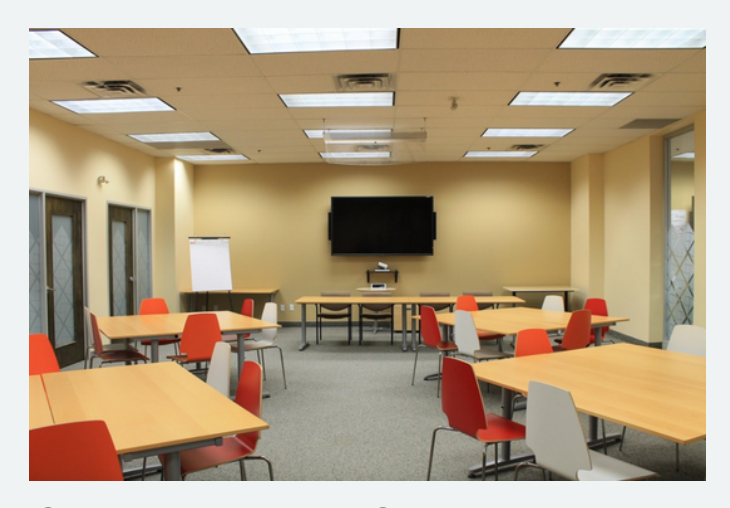
Classroom #2 Seats 32